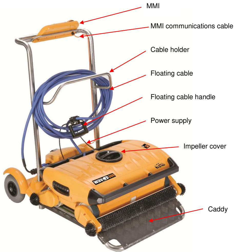
MMI communications cable